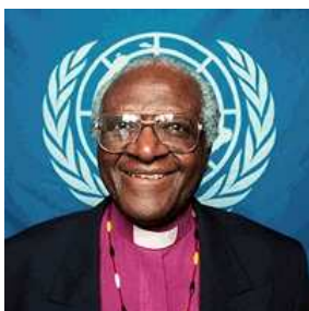
Desmond Tutu 1984 Nobel Peace Prize

"...injustice and gross human rights violations were being perpetrated in Palestine. In the same period the UN took a strong stand against apartheid; ...which helped to bring an end to this iniquitous system. But we know too well that our freedom is incomplete without the freedom of the Palestinians." 1997 3