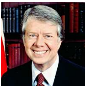
Jimmy Carter 2002 Nobel Peace Prize

"When Israel does occupy this territory deep within the West Bank, and connects the 200-or-so settlements with each other, with a road, and then prohibits the Palestinians from using that road, or in many cases even crossing the road, this perpetrates even worse instances of apartness, or apartheid, than we witnessed even in South Africa." 1