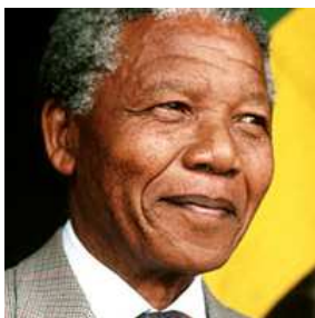
Nelson Mandela 1993 Nobel Peace Prize

"Israel has created in the Occupied Territories a regime of separation based on discrimination, applying two separate systems of law in the same area and basing the rights of individuals on their nationality. This regime is the only one of its kind in the world, and is reminiscent of distasteful regimes from the past, such as the Apartheid regime in South Africa." 2 B'Tselem is an Israeli Information Centre for Human Rights in the Occupied Territories.